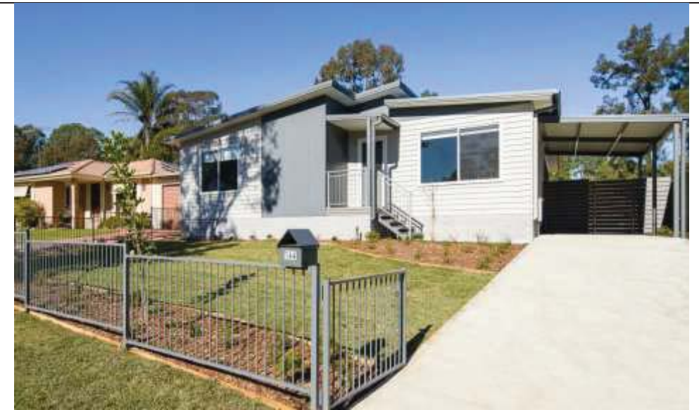
AHO property with cement clad and brick dwarf wall around footings.